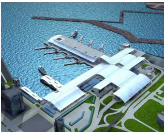
The roof consists of Interlocking profiled trays