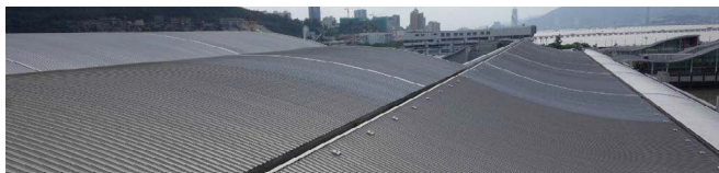
Stainless steel grade 316 is used in the building envelope of the extended Macau Taipa harbour terminal.